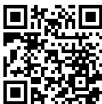
Crystal Valley App Site